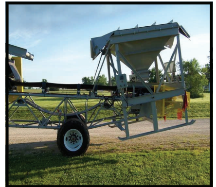
Hopper: Model 560