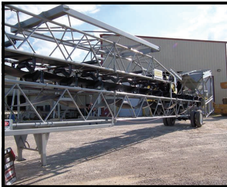
Model 560 Ready to Roll