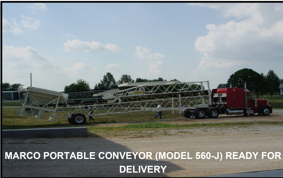
MARCO PORTABLE CONVEYOR (MODEL 560-J) READY FOR DELIVERY

MARCO is uniquely positioned to provide the Ready-Mix industry with a portable conveyor that optimizes both productivity and conveyor life. The MARCO Portable Model 560, is constructed of the tubular components utilized in much larger solutions, but at a price and functionality targeted at the Ready-Mix market's most demanding requirements.